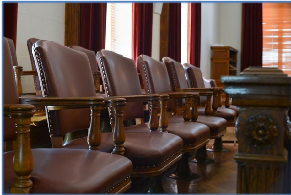
(DENVER CITY & COUNTY BUILDING)

MODEL CRIMINAL JURY INSTRUCTIONS COMMITTEE OF THE COLORADO SUPREME COURT